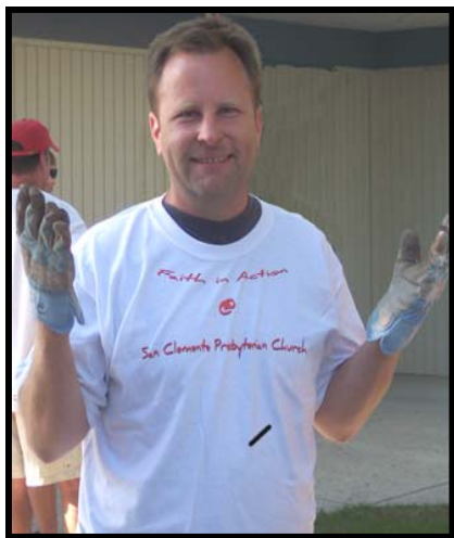
Faith in Action Day at San Clemente Presbyterian.